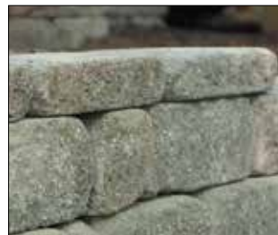
6. Capping the Wall

Place the shouldered fiberglass pins into the holes of the Units (note: place one pin only per each grouping of three holes). Place pins in the middle hole for near vertical alignment or the holes nearest the embankment for a 9.5° +/- setback per course. According to wall requirements and design, the front pin hole (towards the face of the wall) can be used randomly to allow a forward projection of a specific unit for accent and variation in the wall appearance.