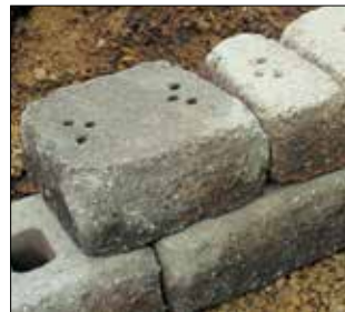
5. Install Additional Courses

Place the first course of units end to end (with front corners touching) on the prepared base. The long groove (receiving channel) on the unit should be placed down and the three pin holes should face up, as shown. Make sure each unit is level - side to side and front to back. Leveling the first course is critical for accurate and acceptable results. For alignment of straight walls, use a string line aligned on the unit pin holes for accuracy. Minimum embedment of base course is 6" below grade.