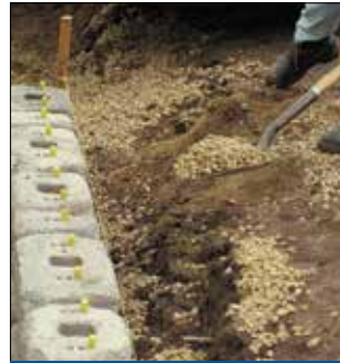
4. Install Fill & Compaction

Remove all surface vegetation and debris. Do not use this material as backfill. After selecting the location and length of the wall, excavate the base trench to the designed width and depth (min. 20" w x 12" d) [500mm x 300mm]. Start the leveling pad at the lowest elevation along wall alignment. Step up in 6" (150mm) increments with the base as required at elevation changes in the foundation. Level the prepared base with 6" (150mm) of well-compacted granular fill (gravel, road base, or 1/2" to 3/4" [10 - 20 mm] crushed stone). Compact to 95% Standard Proctor or greater. Do not use PEA GRAVEL or SAND for leveling pad.