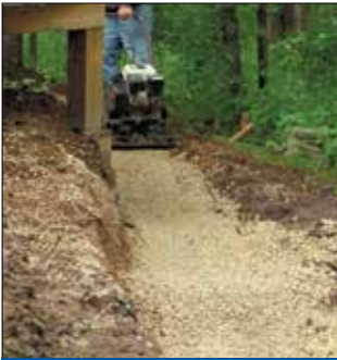
1. Prepare Base Leveling Pad

Remove all surface vegetation and debris. Do not use this material as backfill. After selecting the location and length of the wall, excavate the base trench to the designed width and depth (min. 20" w x 12" d) [500mm x 300mm]. Start the leveling pad at the lowest elevation along wall alignment. Step up in 6" (150mm) increments with the base as required at elevation changes in the foundation. Level the prepared base with 6" (150mm) of well-compacted granular fill (gravel, road base, or 1/2" to 3/4" [10 - 20 mm] crushed stone). Compact to 95% Standard Proctor or greater. Do not use PEA GRAVEL or SAND for leveling pad.